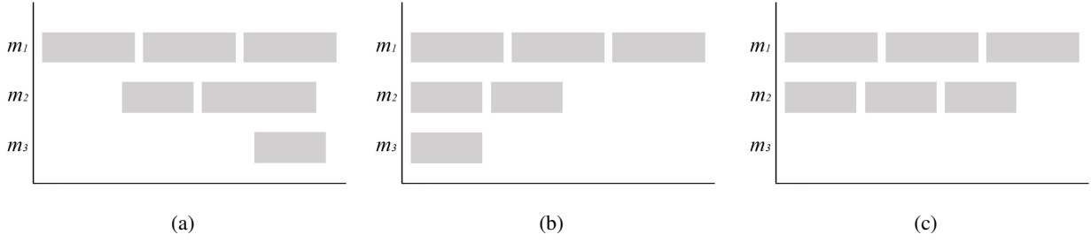
Figure 1: Different schedules involving three machines and six jobs.

A specified amount of time may be required to change from one job to the next one. Specifically, we assume that s_{i,j,k} is the time needed to set up job j directly after job i on machine k . Consequently, these times are referred to as sequence-dependent setup times . Every job j has a positive duration d_{j,k} that depends on the machine k it is assigned to. A schedule S for a problem instance is defined by: